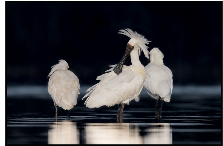
'Royal Spoonbills' - Kim Touzel - Photo of the Year 2018